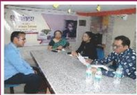
Jawed Habib Hair & Beauty