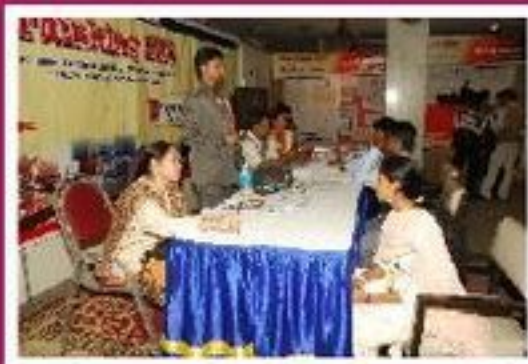
Tranterior Design and Technology Solu