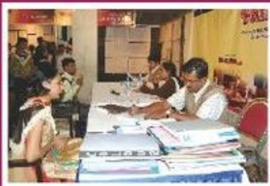
Patron landmark Project Pvt. Ltd