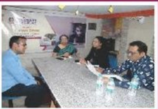
ZSM e Services Pvt. Ltd