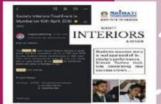
Hafele Design Centre