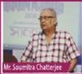
Mr. Soumitra Chatterjee

Late Soumitra Chatterjee was an Indian film actor, play-director, playwright, writer, thespian and poet. He is regarded as one of the greatest and most influential actors in the history of Indian Cinema. He is best known for his collaborations with director Satyajit Ray, with whom he worked in fourteen films & many more. He had blessed our students in the event-THINKING 2K18, Organized by Srimati Techno Institute.