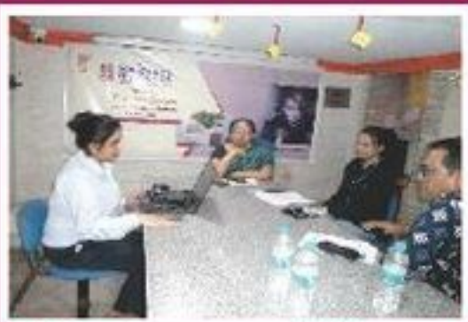
MS. Sumeru Udhyog