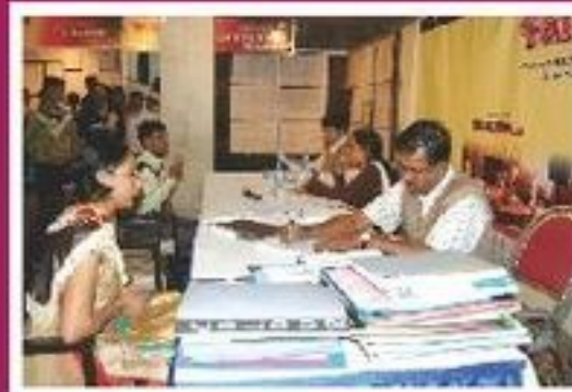
Unmaid Mills Limited