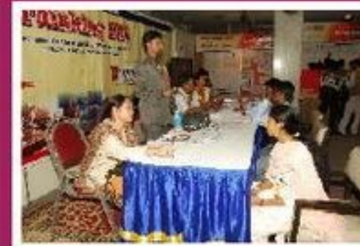
Varun Hi-tech Engineering Services Limited