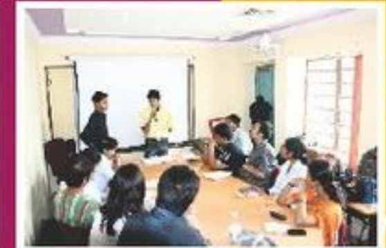
Vensa Infrastructure LTD