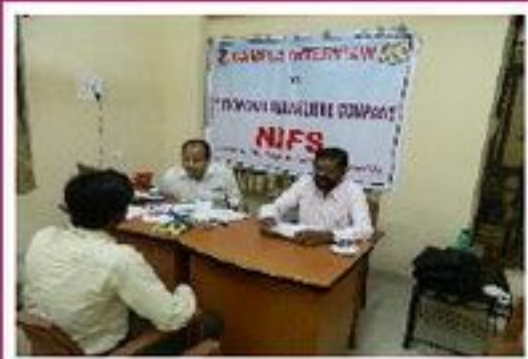
Rahee Infratech LTD